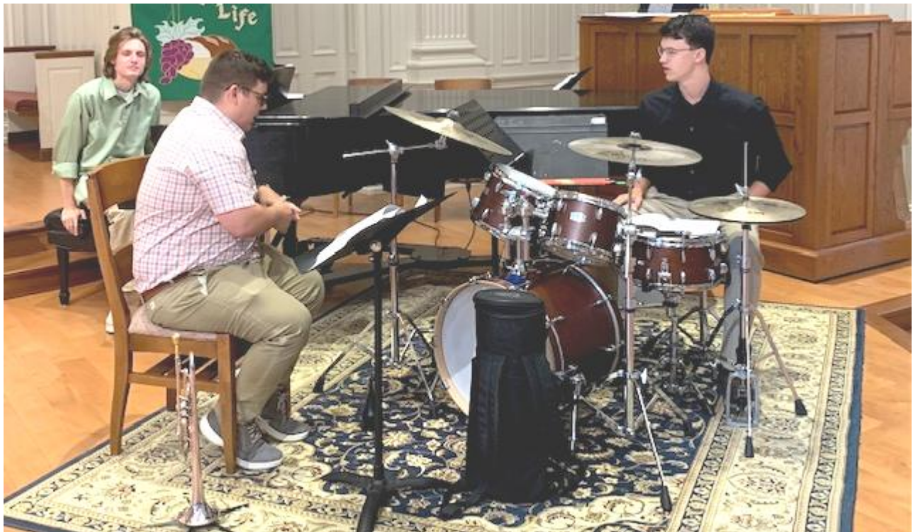
Jazz Group Summer 2024