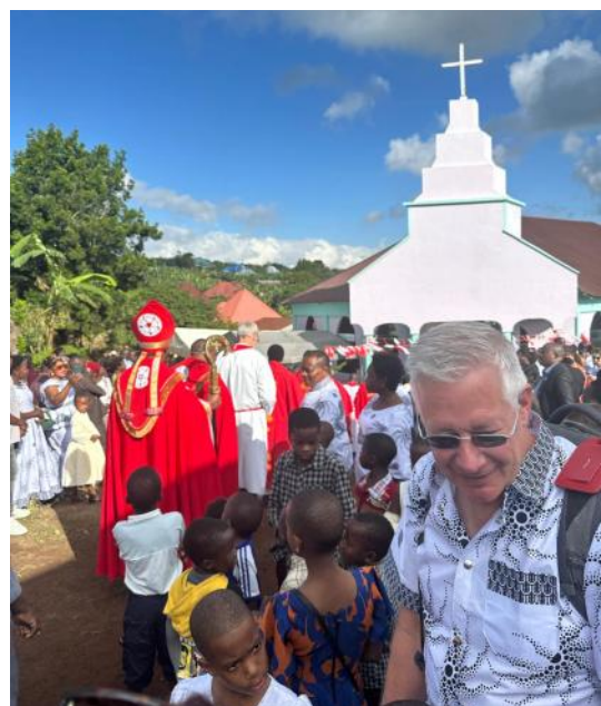
Church Dedication in Tanzania

Thank you to everyone who helped at the Mother's Day Bake sale to benefit Mpuguso Lutheran Church! Everything was delicious! $1960 was donated on the day of the Bake Sale!