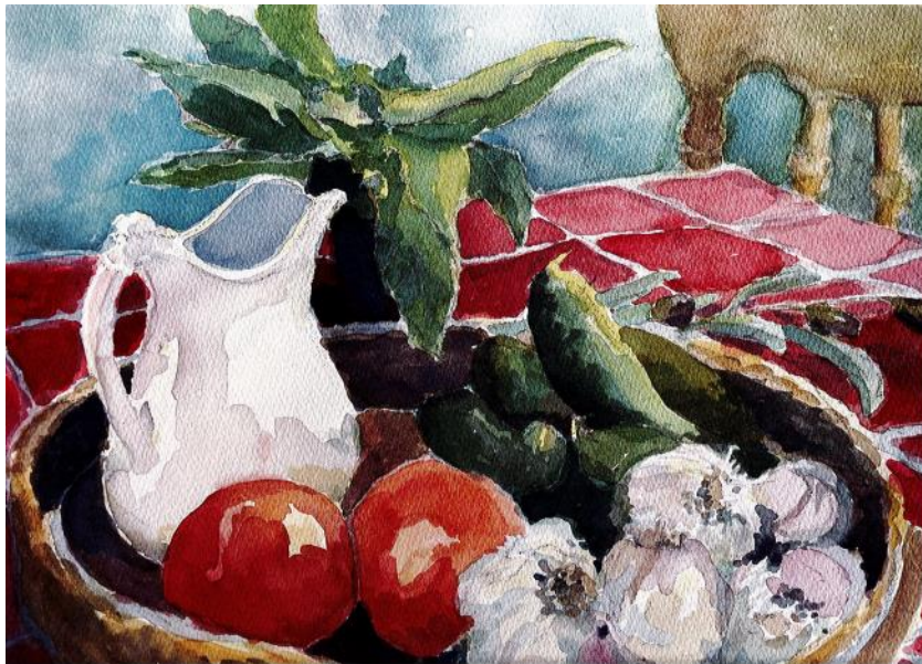
Fresh From the Garden