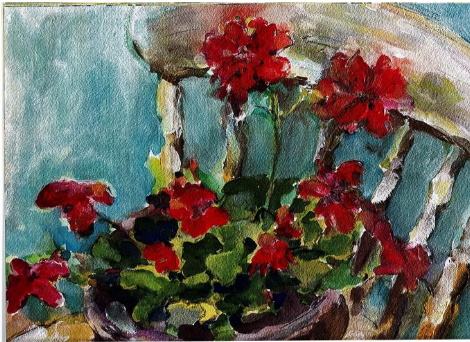
Geraniums on White Chair