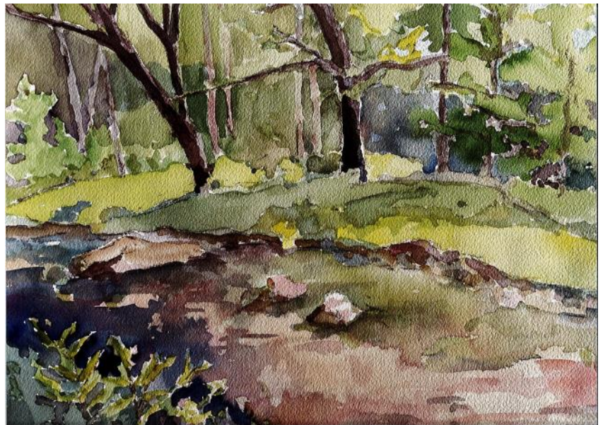
Bear Creek Meadow