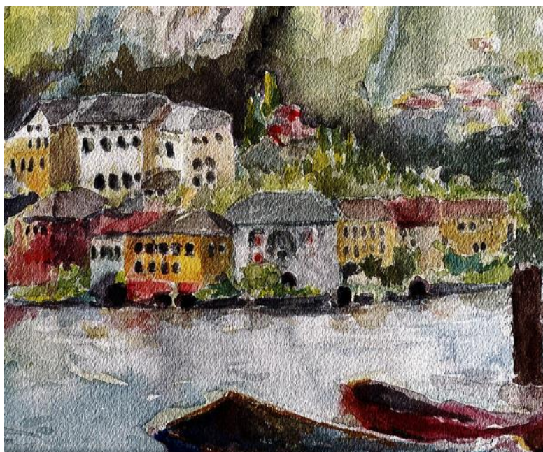
Isle San Julian, Lake Orta, Italy

Please sign on to www.stpaulsyork.org and check out our webpage. There are great pictures in the Gallery and on the slideshow. You will find the monthly newsletter in color, weekly bulletins, monthly calendar and a link to Facebook, the Sunday service on YouTube and opportunities to give electronically. Hopefully, you will find the new webpage helpful and refer to it often.