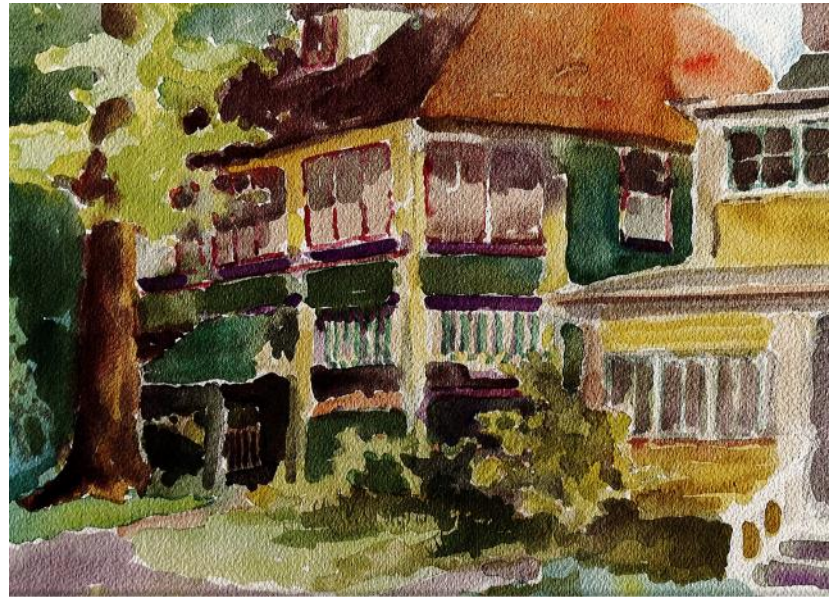
Cookman Aveue, Chautauqua, New York

Please take calendars with you to use as an evangelism tool to assist you in talking about the Lord, Christ Jesus, and the ministry that is carried out in his name through our congregation. This is a fabulous tool to assist you with talking about faith and life with neighbors and friends. With the calendar in hand you can easily talk about the desire to provide a canopy to provide protection from sun, rain and snow! Our neighbors, who come to St. Paul's shopping for food without money (just like the prophet proclaims), will benefit greatly from a monetary donation. It doesn't really matter the dollar amount. What is important is for us to tell the story of how we are doing what Jesus commands, feeding the hungry. The calendar recipient will enjoy 12 months of original art work.