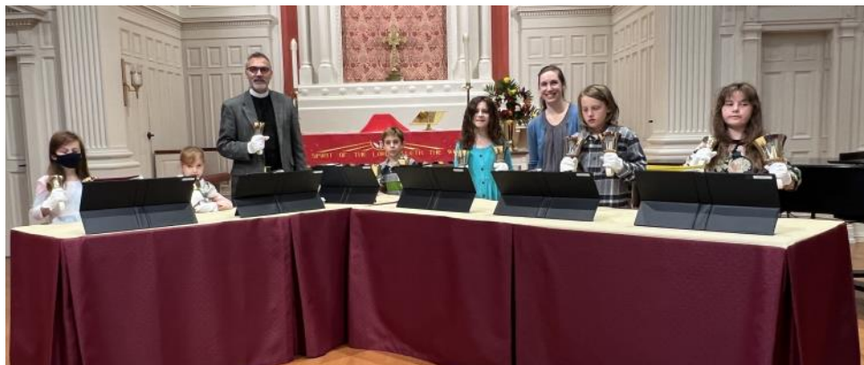
Cantabile Choir's first Sunday to ring in the 2022/23 season.