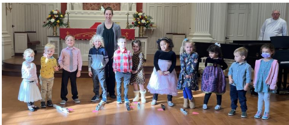
Cherub Choir's first Sunday to play instruments and sing in the 2022/23 season.