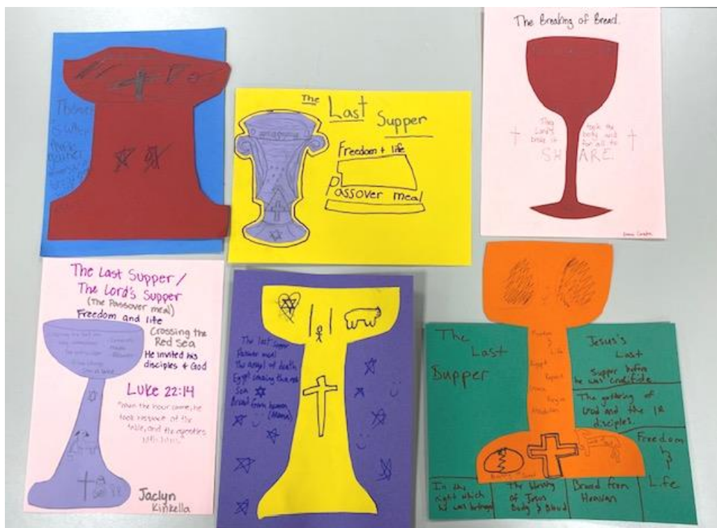
Confirmation projects related to the unit on The Lord's Supper.