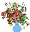
Flowers This Week

8:00 AM Holy Eucharist—Outside 10:30 AM Holy Eucharist - live streamed. 6:30 PM AA meeting Community Rm