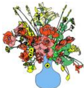
Flowers This Week

8:00 AM Holy Eucharist—Outside 10:30 AM Holy Eucharist - live streamed. 6:30 PM AA meeting Community Rm