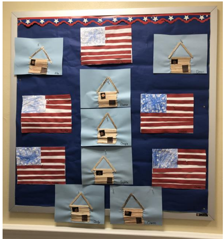
3 year-old class project for President's Day. Well done!