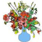
Flowers This Week