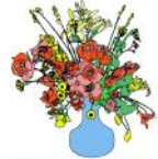
Flowers This Week