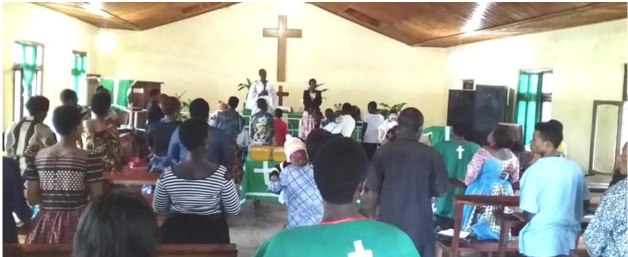
Congregational members attending one of Mpuguso's multiple Sunday church services

In 1984, seven families in Tukuyu, Tanzania began reading the Bible together and worshipping informally in their homes. Over the course of the ensuing decade, other families joined that initial group. By 1994, the Christian enclave in Tukuyu had grown to the point where there was insufficient space in anyone's home to accommodate everyone. Accordingly, those families put their faith in the Lord and moved forward with the erection of a church facility. Their hope was that they would all be able to worship together and then spread the Word of the Lord throughout Tukuyu and the surrounding communities.