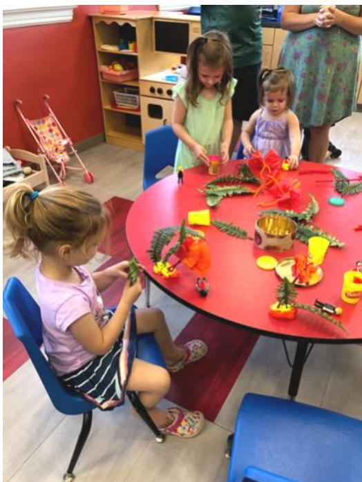
The preschool Sunday School class making “Burning Bushes” to remind them that God spoke to Moses in an amazing way!

Weekly Lectionary Study continues every Wednesday from 10:30-11:30. During this time we read and discuss the Bible lessons that will be used on the upcoming Sunday morning. Deepen your worship through this time of study and reflection. Regular attendance is not necessary. Come any time.