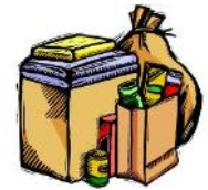
Food Pantry Donations Needed

We need volunteers to sub on Tuesdays mornings to cover for those on vacations. Please contact Teresa Rohrbaugh if you are able to help in this way. Plastic Bags are always needed. Money donations are gratefully accepted. Please place cash or check in a “special” envelope marked “Pantry”.