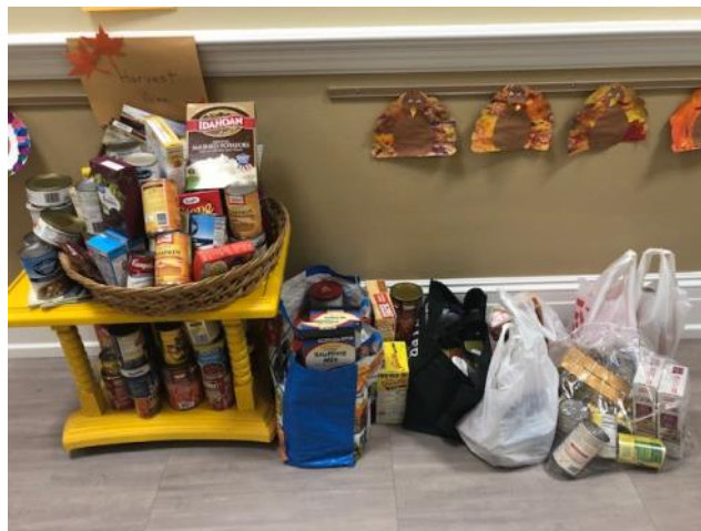
St. Paul's Preschool collected food items for the Food Pantry for Thanksgiving. Here is just a sampling of the generosity exhibited by our kids!