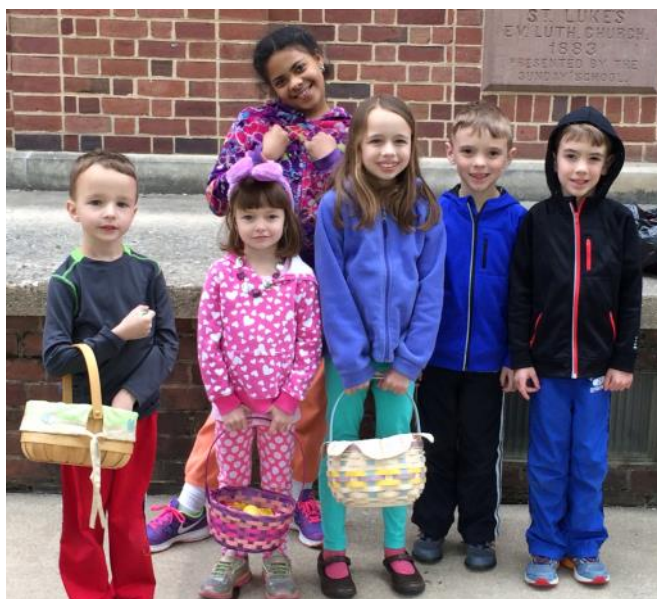
Easter Egg Hunt

*Volunteers are needed on that Saturday at 4:00 p.m. to pick up the boxes of food for our Food Pantry. Please call Teresa Rohrbaugh at 717-817-2372 if you are available to help.